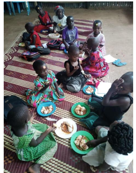
Education Outreach, Namabasa